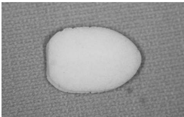
FIG. 1. The multipurpose conical porous polyethylene orbital implant (MCOI) (Porex Medical).

after being soaked in antibiotic solution (Fig. 3). The sclera was closed with 5-0 Vicryl interrupted sutures. The Tenon fascia was closed in 2 layers of 5-0 Vicryl interrupted sutures. The conjunctiva was closed with 6-0 plain gut running suture. An acrylic conformer was placed in the fornices. A tarsorrhaphy was placed using 4-0 silk suture and foam bolsters.